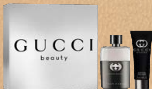
Gucci GUILTY POUR HOMME EDT SPRAY 50ML & SHOWER GEL 50ML £73