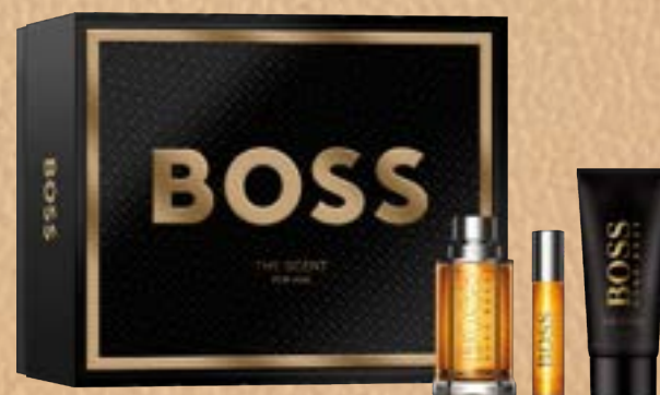
Hugo Boss THE SCENT EDT SPRAY 100ML, TRAVEL SPRAY 10ML & SHOWER GEL 100ML £90