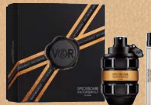
Victor & Rolf SPICEBOMB EXTREME EDP SPRAY 90ML & TRAVEL SPRAY 10ML £105