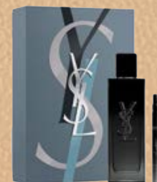
YSL MYSLF EDP SPRAY 100ML & TRAVEL SPRAY 10ML £113