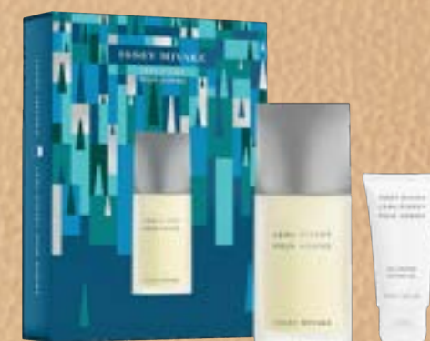
Issey Miyake L'EAU D'ISSEY POUR HOMME EDT SPRAY 75ML & SHOWER GEL 50ML £69