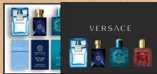
Versace MENS SET EDT/EDP 4 X 5ML £29.99