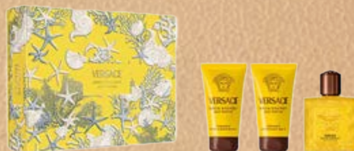
Versace EROS ENERGY EDP SPRAY 50ML, SHOWER GEL 50ML & AFTERSHAVE BALM 50ML £59.99