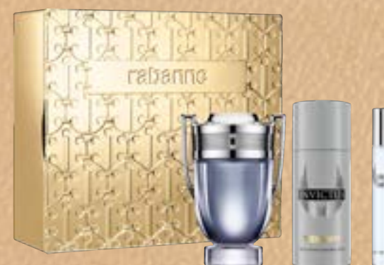
Rabanne INVICTUS EDT SPRAY 50ML, TRAVEL SPRAY 10ML & SHOWER GEL 100ML £66